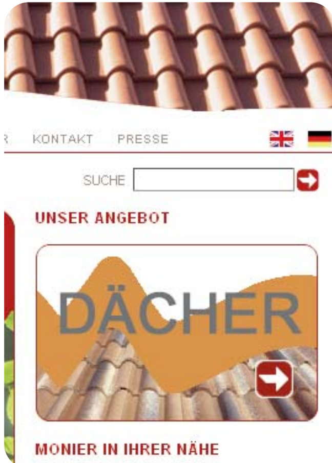
Monier - website and Wikipedia entry

After the demerger from the Lafarge Group, Lafarge Roofing change its name to Monier. As part of the rebranding, Mother Tongue was asked to translate the English website into German. We opted to use our Marketing Translation process, whereby we chose a suitably experienced translator based in Germany to translate the website copy and then the translated copy was given to a Germany-based copywriter to edit and improve it both stylistically and culturally.